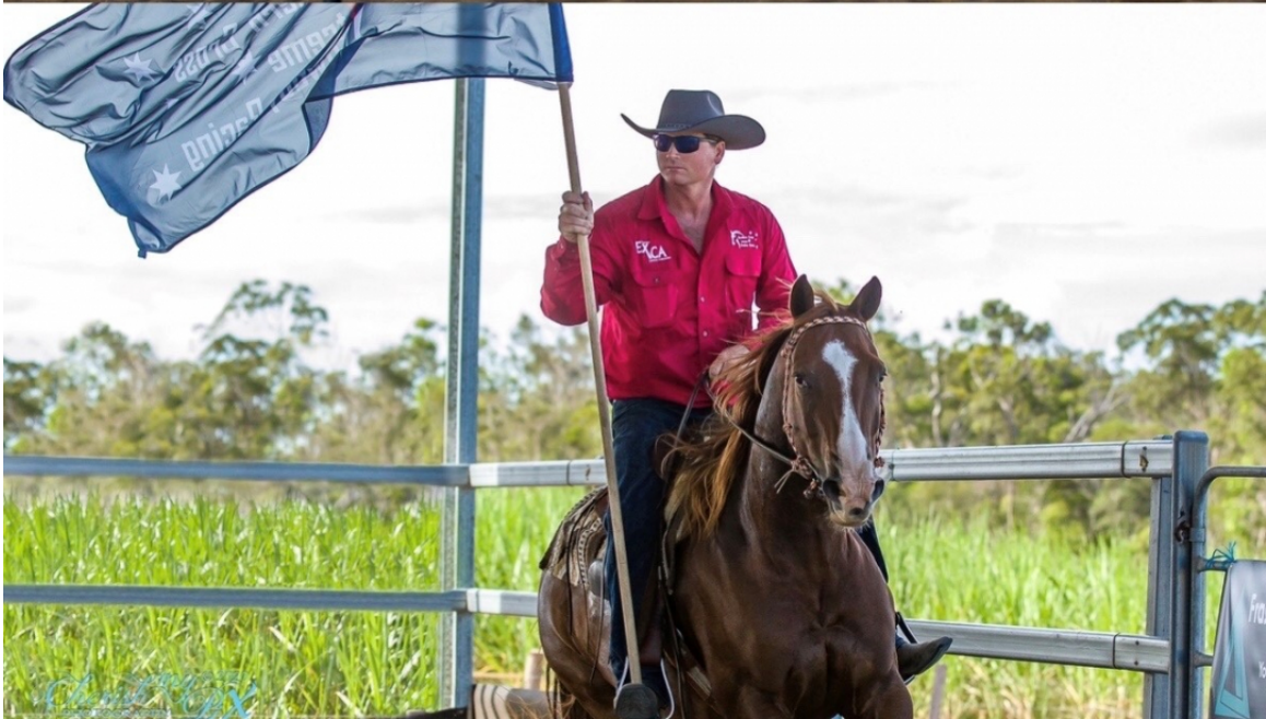
3/22/20 - Southern Cross Xtreme Cowboy